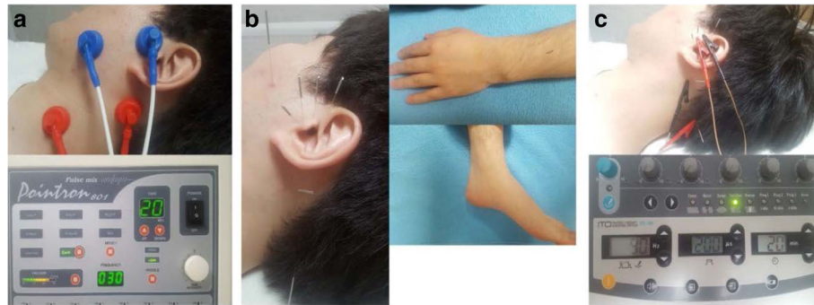
Fig. 3 Pictures of each treatment and electrical stimulation devices. a Electrode attachment sites in the TENS (transcutaneous electrical nerve stimulation) group. b The acupoints of MA (manual acupuncture) group (TE21, SI19, GB2, TE22, ST7, TE17, GB20 of affected side, and GB20, TE05, KI3 of both sides). c Treatment sites of the EA (electroacupuncture) group (11 acupoints of MA group plus electrical stimulation at TE21, SI19, TE17, and GB20)

was selected based on previous clinical studies [22, 25]. Needling depth is approximately 5–10 mm based on the differences in anatomical structure of the participants and the individual characteristics of acupoints. The acupuncture needles are inserted until the participant feels “De-qi”. Acupuncture needles are retained for 20 min.