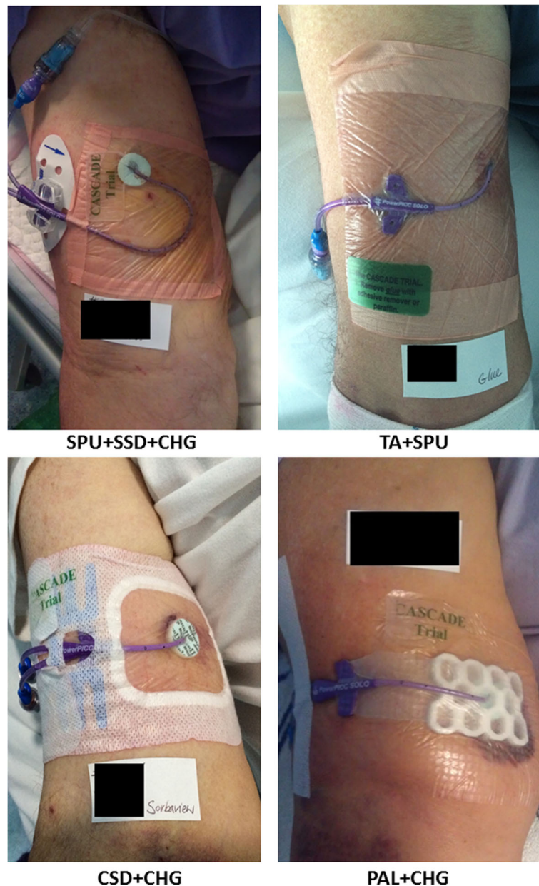
Fig. 1 Dressing and securement methods for each study group. SPU + SSD, standard polyurethane dressing plus a sutureless securement device plus chlorhexidine-gluconate impregnated discs; PAL + CHG + Tape, polyurethane with absorbent lattice pad adhesive plus non-woven tape plus chlorhexidine-gluconate impregnated discs; CSD + CHG, combination securement dressing plus chlorhexidine-gluconate impregnated discs; TA + SPU, tissue adhesive plus standard polyurethane dressing

characteristics (age, gender, diagnosis, immunosuppression, infection status, co-morbidities, weight, skin type/integrity, hand dominance (right/left)); and on device characteristics (location, side (right/left), number of lumens, inserter, number of attempts, skin preparation, and infusates). ReNs visited active patients daily to assess protocol compliance, and to document endpoints and adverse events. PICC removal data were collected on the reason for PICC removal, site complications, dwell time, length of stay, mortality, level of