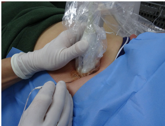
Fig. 1 Ultrasound-guided placing of the pulsed radiofrequency (PRF) cannula at the tender point

Medication usage prior to, and after, treatment will be recorded using World Health Organization (WHO) pain steps. Patient satisfaction is recorded using the Patient Global Impression of Change (PGIC, 1 very much worse to 7 very much improved) and Verbal Rating Scales methodology (VRS, 1 = “I am very satisfied” and 5 = “Pain is worse after treatment”) [4, 21].