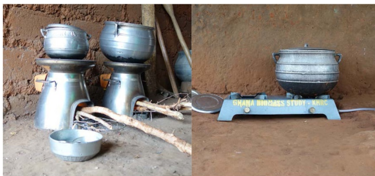
Fig. 1 BioLite (left) and liquified petroleum gas (LPG) (right) cookstoves

In the efficient biomass cookstove arm – hereafter called the “BioLite arm” – households receive two BioLite HomeStove cookstoves (BioLite Inc., Brooklyn, NY, USA). These stoves burn freely available biomass fuels, but do so in a constrained L-shaped combustion chamber that increases heat transfer efficiency relative to