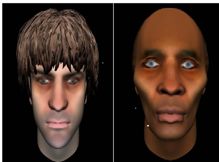
Fig. 2 Examples of avatars

developments within the context of a novel therapeutic milieu. The main goal of this therapy is to facilitate a dialogue between the patient and a computerised representation of their persecutory voice in which the voice hearer is assisted to gain control over the distressing voice. The approach uses computer technology developed by the Speech, Hearing and Phonetics Department at University College London which enables each participant to create a visual representation of the entity (human or non-human) that they believe is talking to them. Additional software is used to transform the voice of the therapist to match closely the pitch and tone of the voice the patient reports hearing, the two processes finally being combined to produce a computer simulation (a virtual agent or 'avatar') through which the therapist can interact with the participant. The therapist promotes a dialogue between the participant and the avatar in which the avatar progressively comes under the participant's control. The sessions are audio-recorded and provided to the participant on an MP3 player for continued use at home [19].