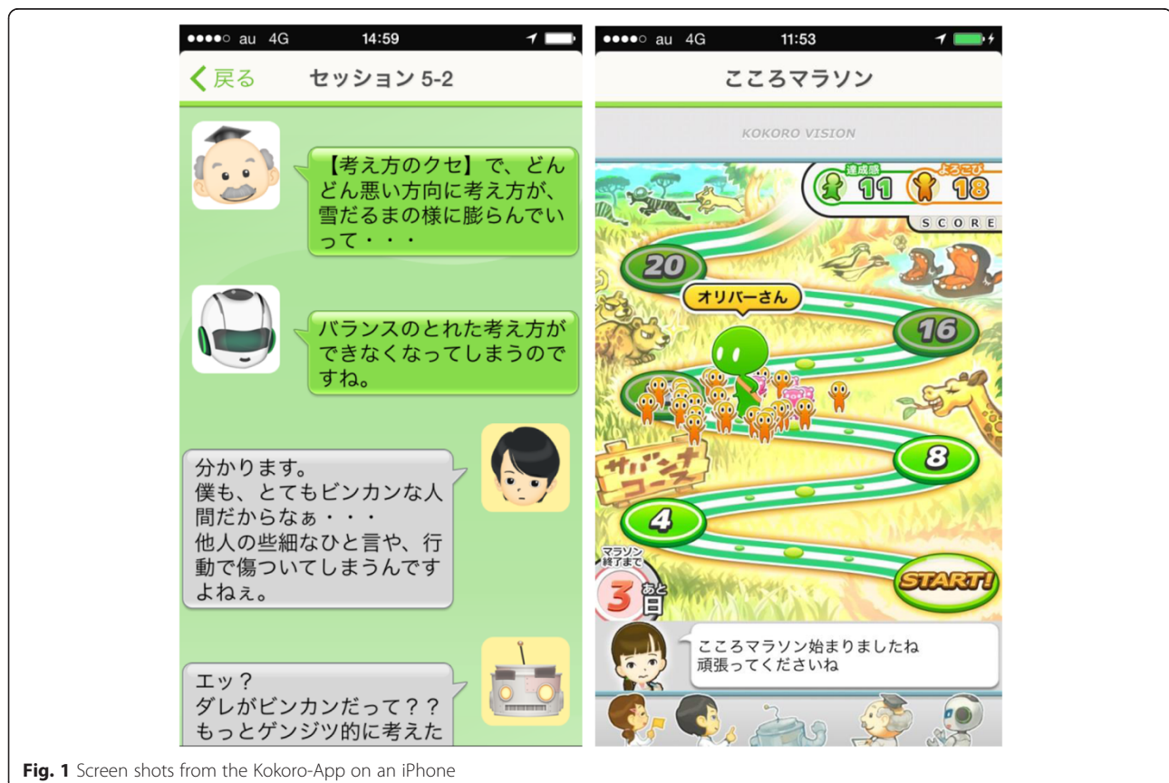
Fig. 1 Screen shots from the Kokoro-App on an iPhone

In the present study, antidepressants that the participants had been taking before entry to the study will be switched to escitalopram or sertraline. A systematic review and a multiple-treatment meta-analysis have suggested that escitalopram and sertraline are the most favorable in terms of the efficacy and acceptability among 12 newer antidepressants [10]. The attending physician will start escitalopram or sertraline at entry (week 0) and aim to stop antidepressants other than these two by week 5 and to prescribe either 5–10 mg/day of escitalopram or 25–100 mg/day of sertraline at week 5.