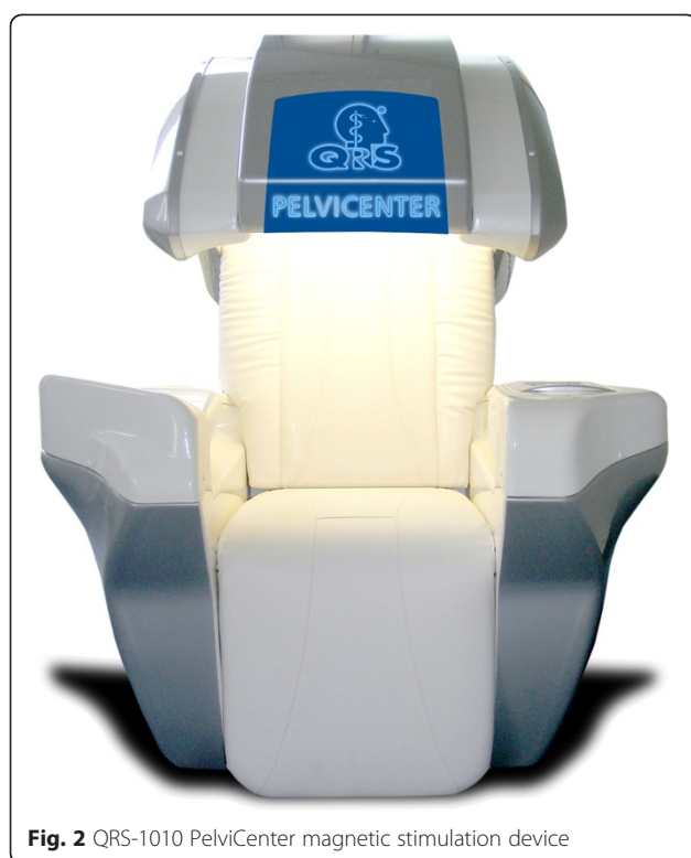
Fig. 2 QRS-1010 PelviCenter magnetic stimulation device

occurs. During this consistent trajectory, a sufficiently large membrane depolarization will result in an action potential along the nerve tissues. In the pelvic floor, this leads to pelvic floor nerve stimulation (stimulation of motor end plates) and ultimately pelvic floor muscle contraction [11, 23].