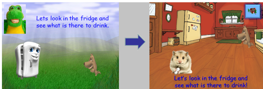
Fig. 1 Video-game modification

themselves. Participants will be able to withdraw from the trial at any time and this will not affect access to their treatment at the hospital.