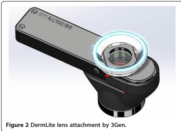
Figure 2 DermLite lens attachment by 3Gen.

photograph to the repository, they are asked a series of questions including: (1) date the photo was taken, (2) if they had previously submitted a photo of that particular mole, mark or spot, (3) location of the mole, mark, or spot (with a drop down menu of options to select from), and, (4) symptoms of the mole, mark or spot (with a drop down menu of options to select from). The photos will be reviewed by study staff to ensure acceptable quality and content before they are sent to the study dermatologist. The photographs will be reviewed by the study dermatologist and an individualized report and status will be generated for each photograph (for example, (a) morphology is suggestive of a benign lesion; (b) morphology is indeterminate and management will require evaluation and follow-up with a physician; (c) lesion has morphologic features suggestive of malignancy; and, (d) image is of insufficient quality - photograph needs to be retaken). The report will be sent to the corresponding participant's physician. The participant will be instructed to contact his or her identified physician to receive the teledermoscopy report and to discuss follow-up measures.