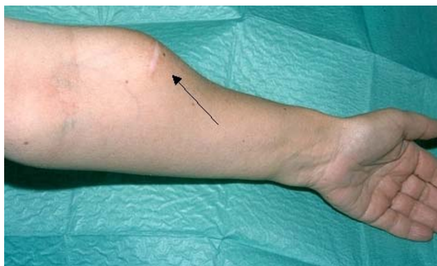
Figure 1 This figure shows the enlargement of a parathyroid autograft in a patient with recurrent secondary hyperparathyroidism, demonstrated by a knob underneath the scar.

Total parathyroidectomy without autotransplantation and without routinely performed thymectomy (TPTX) may provide an alternative strategy to the currently performed procedures mainly because of the reported lower rate of recurrent sHPT of 0–4% during long-term follow up [32,36]. Patients after TPTX did not develop hypoparathyroidism [32,36] and particularly adynamic bone dis-