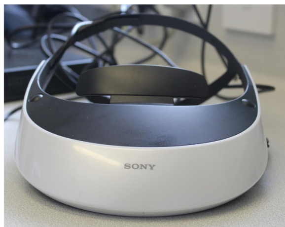
Figure 2 The head-mounted device (HMD).

The sample size calculation (with a power of 0.80, significance level of 0.05 and based on 2-sided testing) is based on one of the main outcomes related to memories, 'intrusive thoughts', as measured with an 11-point verbal rating scale. In our pilot study, the standard deviation for this outcome in our control group was 1.25 and we have conservatively used an estimated standard deviation of 1.3 in this sample size calculation. Based on these assumptions, and comparing the two VR groups against the control group, following up a total sample size of 90 patients (that is, 30 per group) would allow the detection of a between-group difference of around 0.82 units (that is, a moderate effect size). Since drop-outs are unavoidable when collecting follow-up data, this number needs