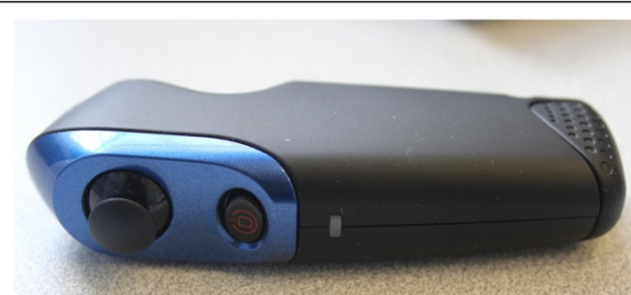
Figure 3 The Zeemote JS1 thumb stick controller.