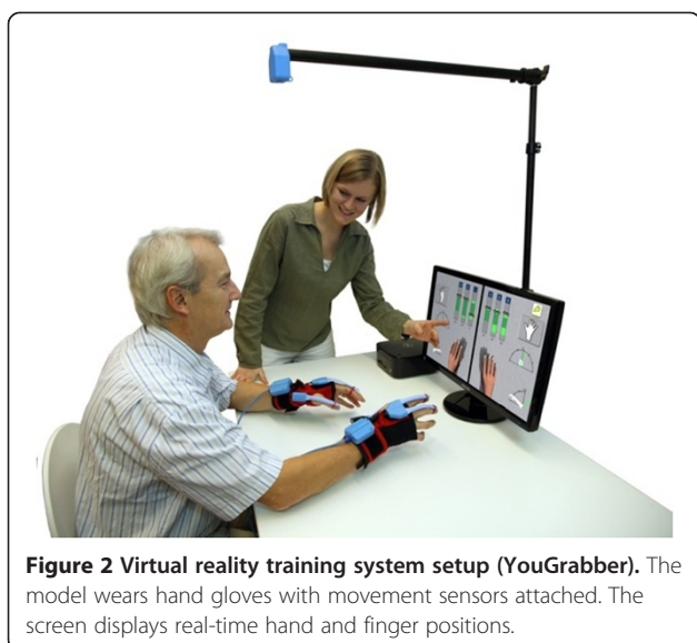
Figure 2 Virtual reality training system setup (YouGrabber). The model wears hand gloves with movement sensors attached. The screen displays real-time hand and finger positions.

the Chedoke Arm and Hand Activity Inventory (CAHAI) and the Line Bisection Test (LBT) and subjectively with the Stroke Impact Scale (SIS).