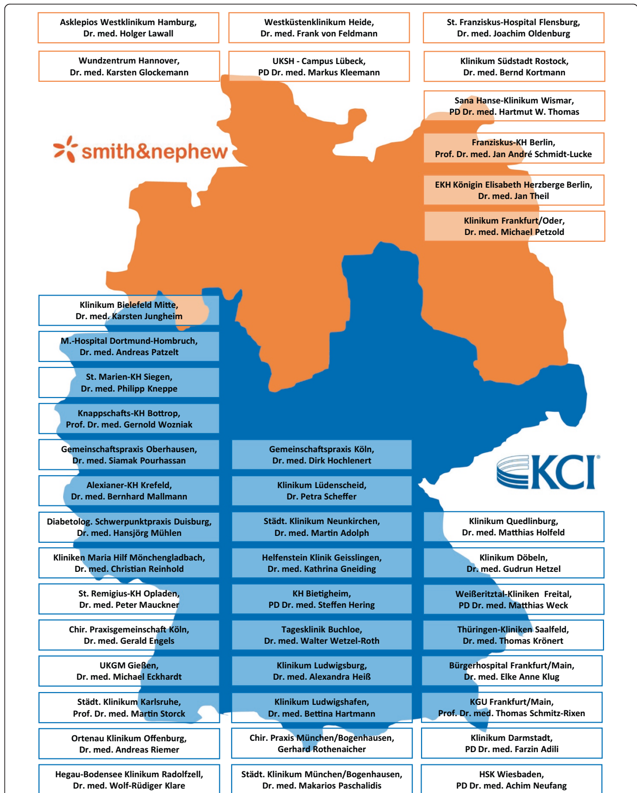
Figure 2 DiaFu study sites. Recruitment of study patients is performed in hospitals and outpatient facilities across Germany with a specific qualification for the treatment of chronic diabetic foot wounds. The table lists all study sites ready for patient recruitment as of 25 October 2013.