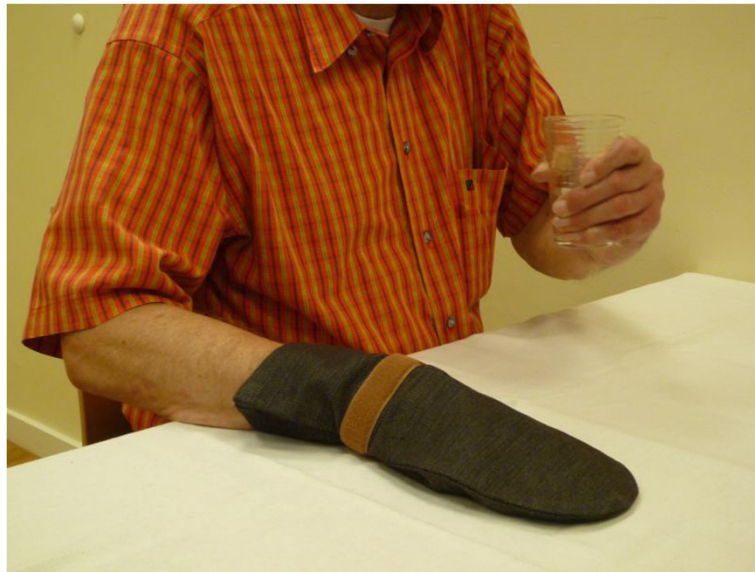
Figure 2 Therapy concept. This figure illustrates one of the key therapeutic principles of CIMT: restriction of the less affected hand induces the patient to use the affected arm to drink a glass of water as a typical activity of daily living.

intervention, therapists will provide weekly home visits to instruct the patients and to supervise the training (five home visits in total, equal to ten treatment units or 250 to 300 minutes). To support the therapists in delivering this new therapeutic concept, an expert telephone hotline will be provided.