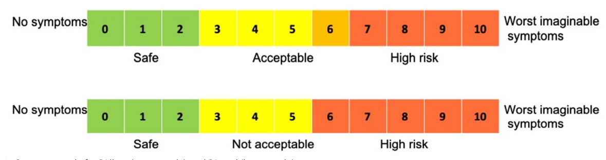
Fig. 3 Symptom scale for PAllow (upper scale) and PAvoid (lower scale)

These minimal loading exercises (exercise A-E) are performed for 6 weeks (Table 1). Sliding; Levy; Supine band; Rowing (exercise A-D) in different levels are the main exercises in PAvoid and close chain exercise (exercise E) is used in case of tissue irritability (level 1). In the second part of the exercise protocol (weeks 7–26), increased loading exercises (exercise F–K) are applied, however, without pain exceeding NPRS 2 (Supplementary file 3).