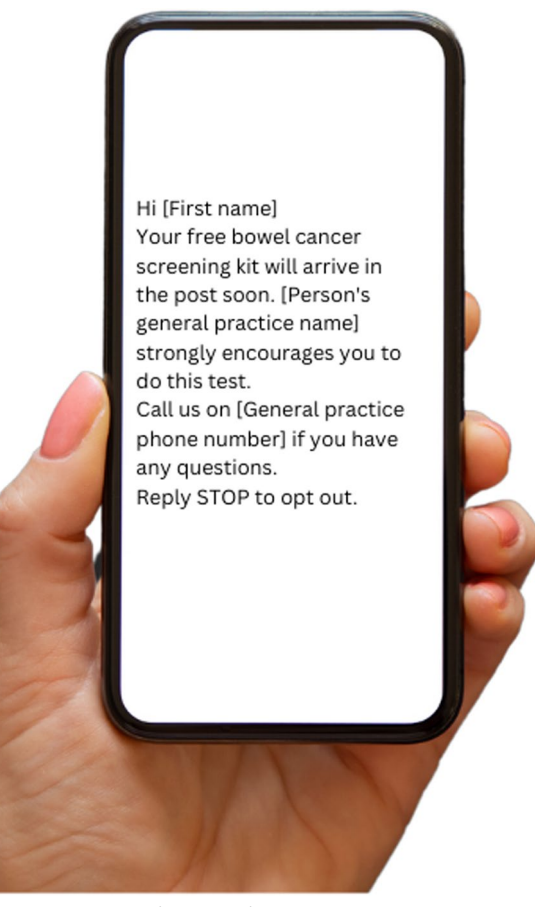
Fig. 1 Intervention 1, the SMS only

Intervention 1: 'SMS only'—an SMS will be sent from the general practice to prompt patients to do the NBCSP kit. The SMS contains a personalised greeting to the patient using their first name only, the general practice name and telephone number, and a GP endorsement of the NBCSP (Fig. 1). The SMS will be delivered by GoShare, an online tool developed by Healthily, a company