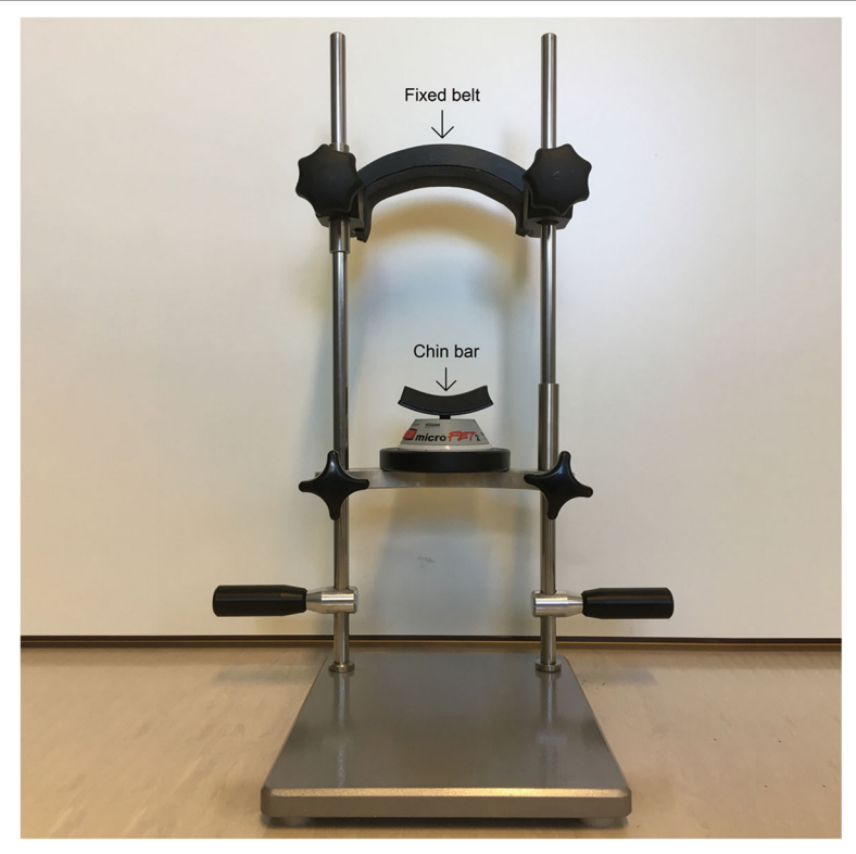
Fig. 2 Examination frame and dynamometer (MicrofetTM, Biometrics, Almere, The Netherlands)

Baudelet et al. Trials (2020) 21:237 Page 6 of 10