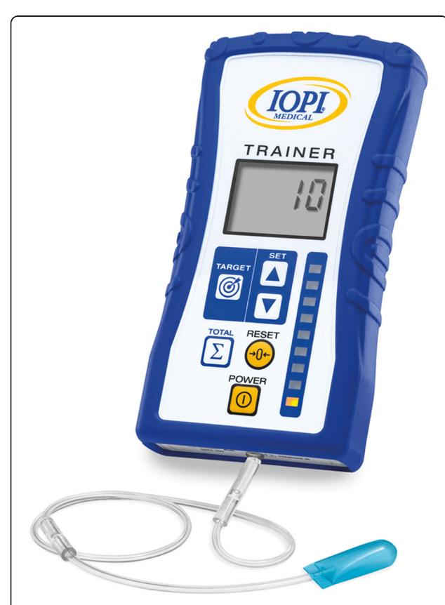
Fig. 1 lowa Oral Performance Instrument, model 3.2 (IOPI Medical LLC, Woodinville, WA, USA)

Maximal chin-tuck strength (in Newtons, N) is measured by means of a dynamometer (Microfet™, Biometrics, Almere, The Netherlands) (Fig. 2). Patients are asked to place their chin on the chin bar and keep their mouth and teeth closed. A fixed belt stabilizes the patients' head. They are instructed to press their chin down