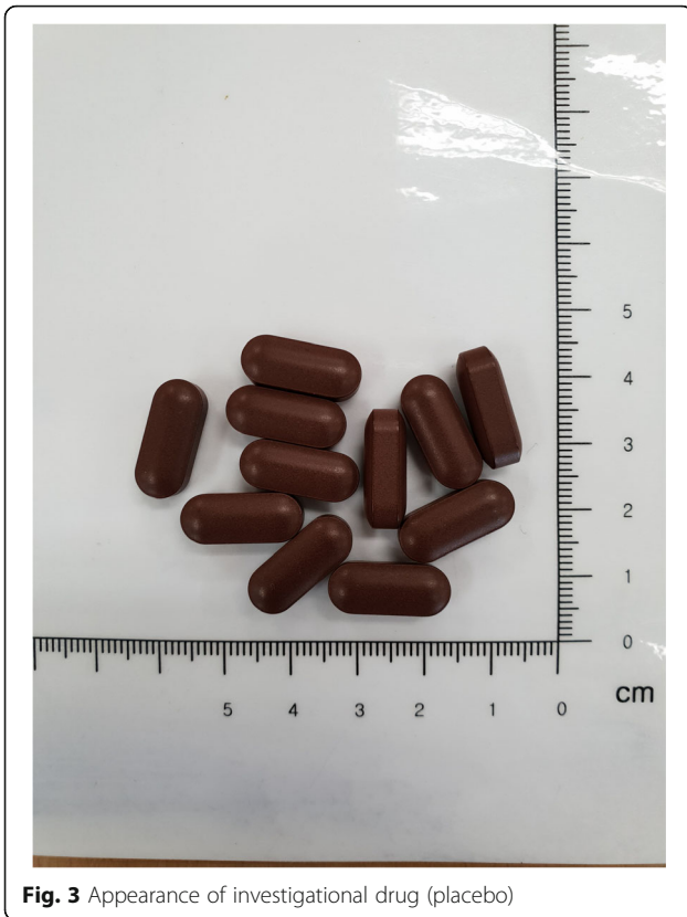
Fig. 3 Appearance of investigational drug (placebo)