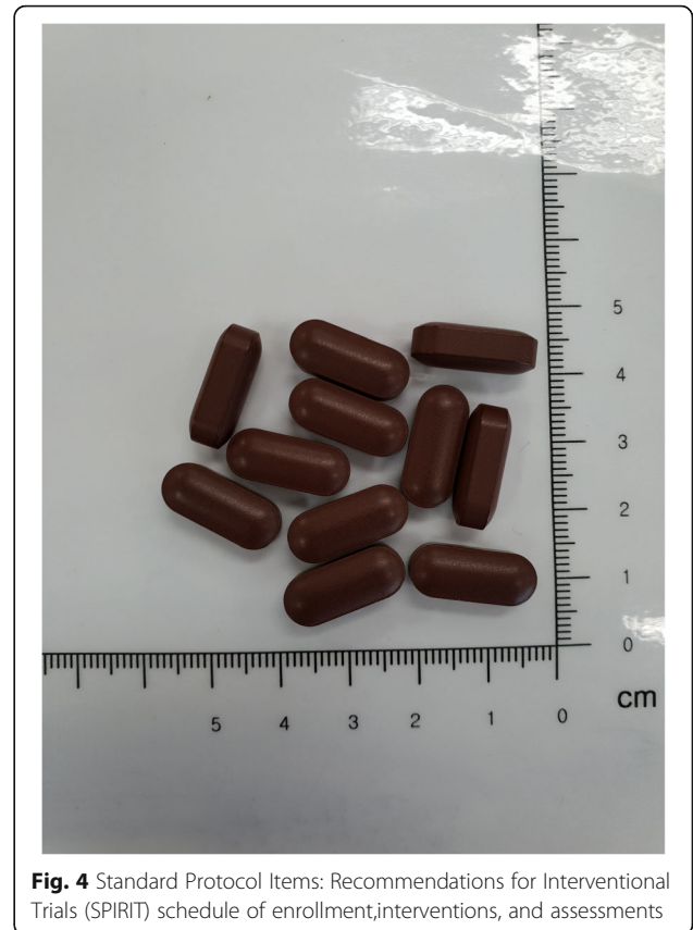
Fig. 4 Standard Protocol Items: Recommendations for Interventional Trials (SPIRIT) schedule of enrollment, interventions, and assessments

[14], and is being used in this trial. This tool contains a five-item description section and a visual analog scale (EQ-VAS) [15]. The five-item description section includes questions on mobility, self-care, usual activity, pain and discomfort, and anxiety and depression. There are three possible responses to each item (no problems, some problems, and severe problems). The participants indicate their present health status by checking the most appropriate score for each of the five items. The EQ-VAS is a self-recorded health score for which the best imaginable health condition is 100 points and the worst is 0 points. The change in the score for each item of the EQ-5D between randomization (visit 2) and after treatment (visit 5) will be measured.