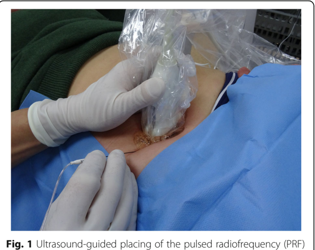
Fig. 1 Ultrasound-guided placing of the pulsed radiofrequency (PRF) cannula at the tender point

Medication usage prior to, and after, treatment will be recorded using World Health Organization (WHO) pain steps. Patient satisfaction is recorded using the Patient Global Impression of Change (PGIC, 1 very much worse to 7 very much improved) and Verbal Rating Scales methodology (VRS, 1 ="I am very satisfied" and 5 = "Pain is worse after treatment") [4, 21].