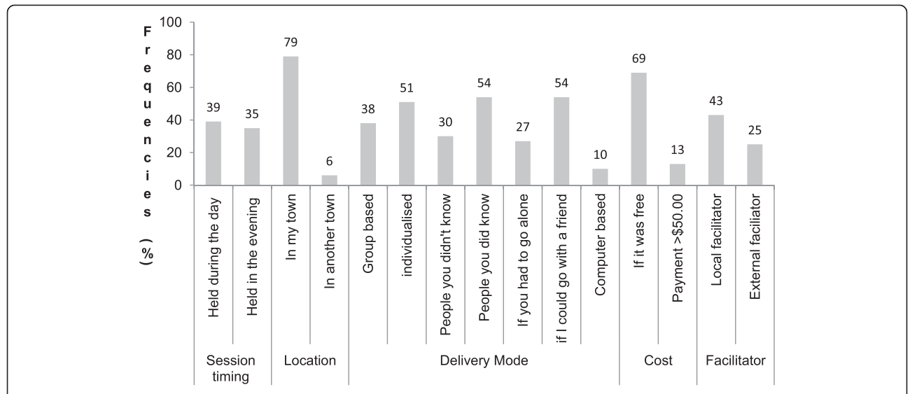
Fig. 2 Factors encouraging program engagement reported by participants. Data collected at baseline (quantitative data); this provides an overview of the factors most likely to encourage program engagement reported by participants (control and intervention) at baseline. Factors have been grouped into five categories: session timing, location, delivery mode, cost and program facilitator. A higher frequency (%) reported indicates that a greater number of participants agreed that this factor would positively encourage program engagement

"I was sort of on watch to manage my weight and change some habits to keep my blood sugar under control" (Intervention participant).