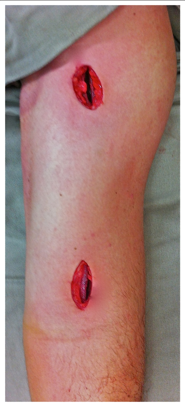
Figure 4 Surgical incisions for minimally invasive bridge plate osteosynthesis.

radiographs will be obtained, and the wound will be sutured and bandaged The patient will be kept immobilised with a sling until ambulatory evaluation.