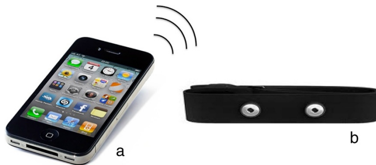
Figure 3 Mobile setting hardware units. a ) the smartphone (iPhone 4S); b ) the shimmer, (University of Pisa).

interaction in the virtual world, the participants will be able to face the real world.