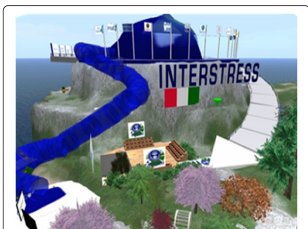
Figure 6 Learning island screenshot.

the smartphone, participants will also be taught how to become aware of their physiological levels of stress. On the mobile phone they will have the possibility to observe a simple graphic of their stress level on that day and during their week. Moreover, the mobile application provides warning signals when critical thresholds are overcome, giving the participant the opportunity to perform a relaxing exercise to reduce his or her stress level.