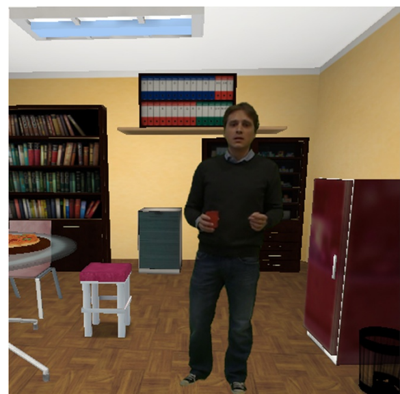
Figure 4 Virtual reality stress scenario screenshot.

In the INTERSTRESS trial, for the relaxation training, relaxing environments will be presented together with relaxing audio narratives based on guided imagery procedures and developed according to emotive engineering principles [50,51]. The INTERSTRESS relaxation