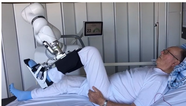
Fig. 2 ROBERT® can hold the patient's leg and perform extension of hip and knee