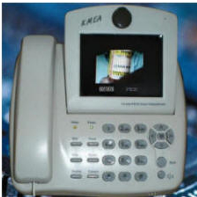
Figure 2 Videophone.

Treatment sessions for the Telepsychology condition will be conducted using in-home videoconferencing technology. We will use an analogue videophone (KMEA TV500SP, Figure 2) that operates via plain old telephone service (POTS). Apart from the video screen, this equipment appears and functions much like a basic touch-tone telephone. It is a "plug-and-use" product, with built-in camera, full duplex speakerphone, 4-inch LCD color screen (270 K pixels) with real-time motion display (18 frames per second), and oversized touch-tone buttons for easy use by all patients. This equipment is simple to use. If necessary, project or clinic staff will be available to visit participants in their homes to help set up the equipment. We will track the type and amount of assistance required across sessions in order to help anticipate future difficulties with in-home use.