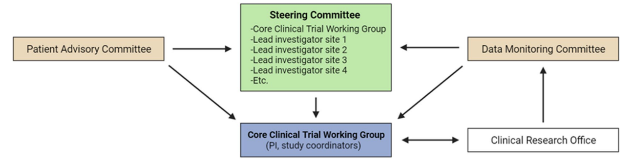
Fig. 3 Governance structure. The Core Clinical Trial Working Group (CCTWG) will be responsible for the day-to-day trial management. The steering committee (SC) consists of the CCTWG and the principal investigators of each participating site and is tasked with major decisions regarding the study progress and design. The Data Monitoring Committee (DMC) is responsible for the safety of participants and advises the SC based on the interim analysis. A Patient Advisory Committee has been appointed to advise the SC regarding any patient-related matters. The Clinical Research Office is responsible for, among others, monitoring the trial and for providing safety data that can be assessed by the DMC and be sent to the competent authorities