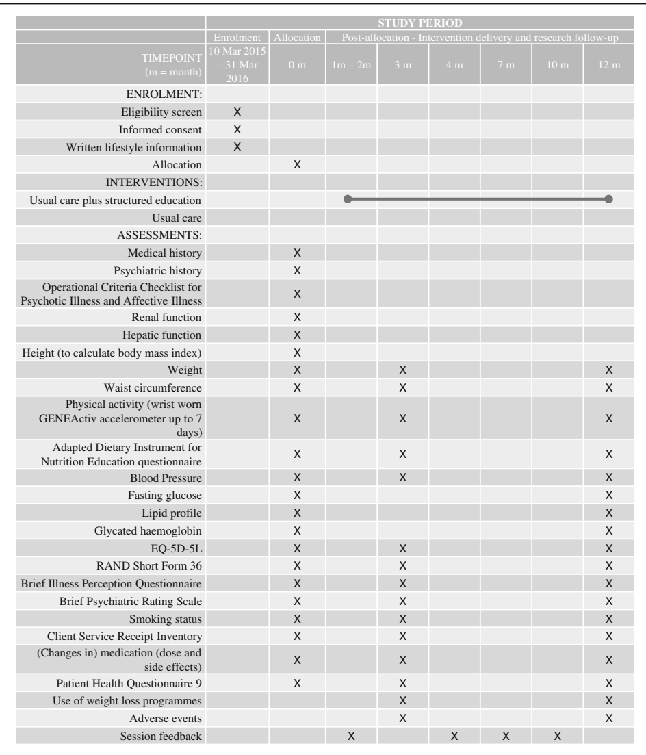
Fig. 2 SPIRIT Figure – Schedule of enrolment, interventions, and assessments, based on recommendations for Interventional Trials (SPIRIT) figure, for the STEPWISE trial. Following enrolment, all participants receive written lifestyle information; and, before collection of 0 month assessments. Participants are then randomised to either usual care with structured education or usual care. Participants allocated to structured education are invited to: a) 4 weekly 2.5 hour group sessions (delivered by trained facilitators); group booster sessions at 4, 7 and 10 months post-randomisation; and, 1:1 support contact between month 2 and month 12. Research assessments are completed with all participants at 0, 3 and 12 months (as indicated)

randomisation where recruitment is close to the scheduled education course.