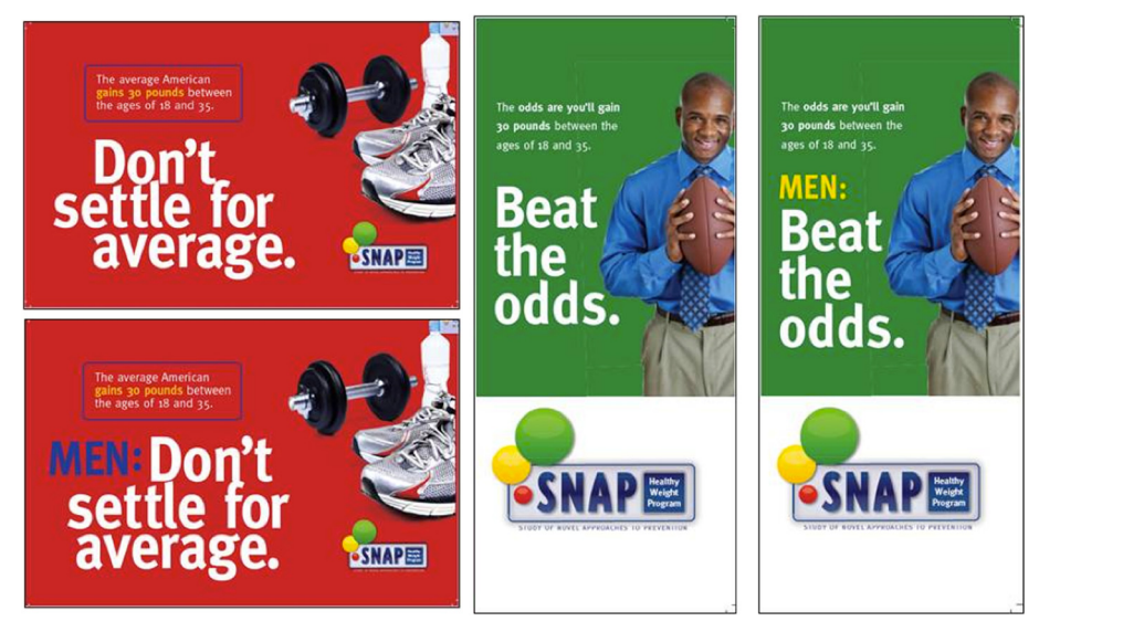
Fig. 1 Front of recruitment materials. Top left Generic Postcard, bottom left Targeted Postcard, middle Generic Brochure, right Targeted Brochure

The postcards (216 mm x 139.5 mm; see Fig. 1 and Additional file 1) included a brief description of the SNAP study including the general purpose of the study, eligibility criteria, and study sponsors. The postcards were full-color, two-sided, and contained 156 words in the study description. The brochures (tri-fold, two-sided, full-color, 216 mm × 279 mm unfolded) contained the same information as the postcards but also included additional information hypothesized to make the message more persuasive. During formative work for this study, young adults in focus groups stated that the immediate benefits of participating in the study would be more persuasive than focusing on the longer-term benefits [8]. To address this, the brochures included a list of immediate benefits of participating in the study (including free personalized analysis of nutrition and