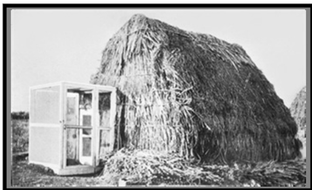
Figure 1 A screened entrance to a thatched house in rural Italy in 1900, in an experiment where screening reduced malaria by 96% [20]. This illustrates that even extremely poor housing can be protected from mosquitoes.

The literature review of Lindsay et al. provides compelling evidence that house screening has been associated with protection against malaria transmission, infection and morbidity[12]. Furthermore, a pilot study conducted in The Gambia using experimental huts demonstrated that netting ceilings alone can reduce exposure to malaria vectors by 80%[13]. In this situation, most mosquitoes entered the huts through the open eaves and were effectively trapped in the roof space. Further studies in actual village houses are needed to confirm these findings and to assess the acceptability of the intervention to house-holders.