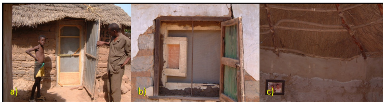
Figure 2 Installation of full screening intervention: a) screened door, b) screened window, c) closed eaves.

Sheets of 2.4 m wide white PVC-coated fibreglass netting (Vestergaard Frandsen group, Denmark) will be cut to fit the room (leaving at least 50 cm overhang on all sides),